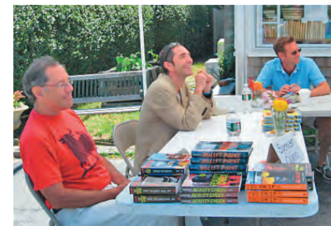
The Brewster Book Store welcomed four "authors who write about dogs" at a Sampson Fund book signing in July.