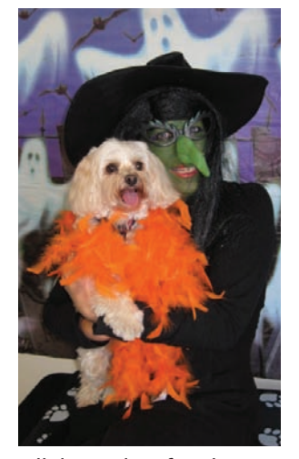
All dressed up for The Halloween Howl at The Howl-A-Day Inn.