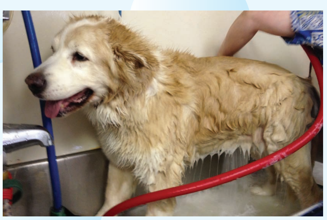
Dogs of all sizes and breeds attended The Sampson Fund dog wash in July.