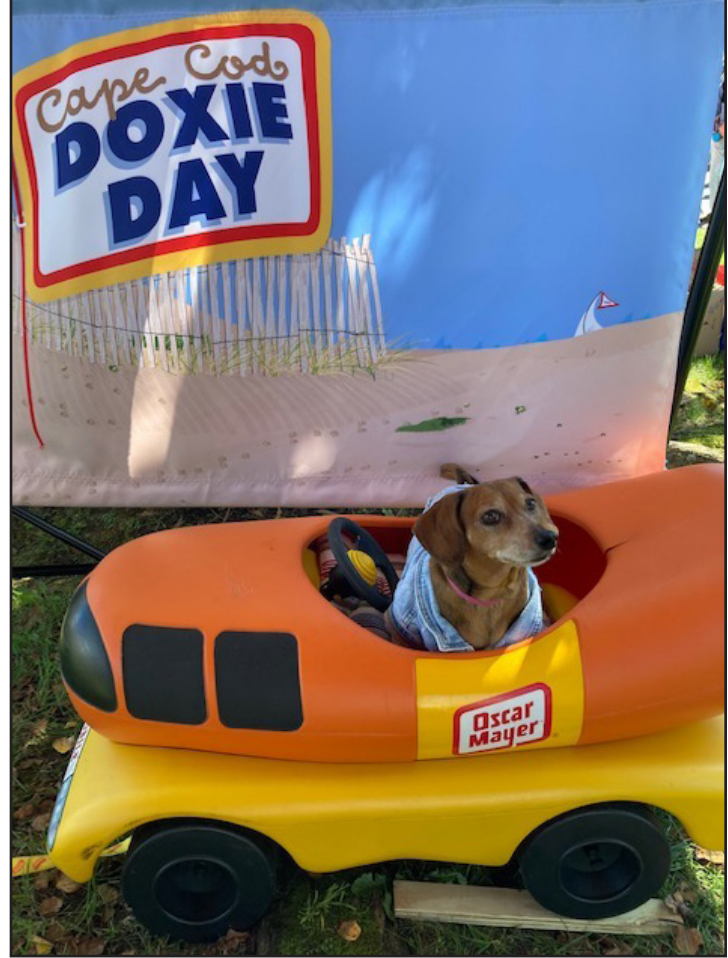
Having fun on Doxie day