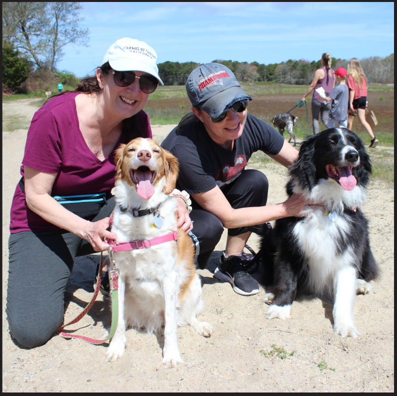
Dogs and their people at last year’s Walk ‘n Wag.